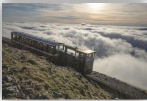
Snowdon Mountain Railway

Wales was a centre of the Industrial Revolution. In fact, Wales was the birthplace of the first steam-powered train . Even today, you can see and ride many historical trains, such as the Snowdon Mountain Railway, which is over 100 years old, and the Blaenavon heritage railway, which takes you on a trip through a UNESCO World Heritage site.