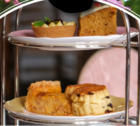
Betty Botter bought some butter

Scan the QR code to listen to the latest episode!